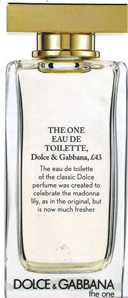
DOLCE & GABBANA the one

The eau de toilette of the classic Dolce perfume was created to celebrate the madonna lily, as in the original, but is now much fresher