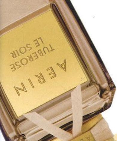
TUBEROSE LE SOIR EAU DE PARFUM, Aerin, £145